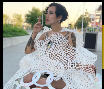
Reclaimed garment bags and plastic plates