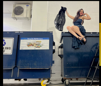
Finding new materials via city dumpsters