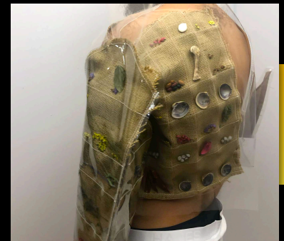
Jacket with seashells, bones, leaves, herbs, etc.