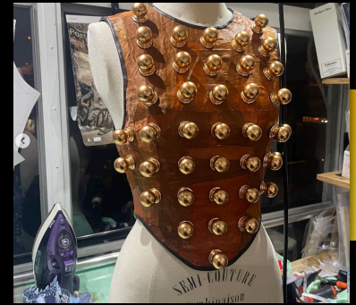
Door handle vest