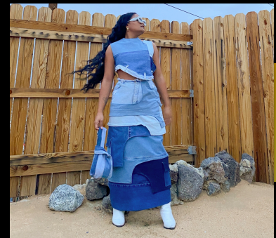
Recycled denim top and skirt

Casting Note: She appeared on Project Runway Junior in 2015/16.