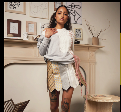
Skirt made out of vintage neckties