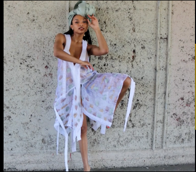
Organza fabric filled with herbs (coriander, cinnamon)