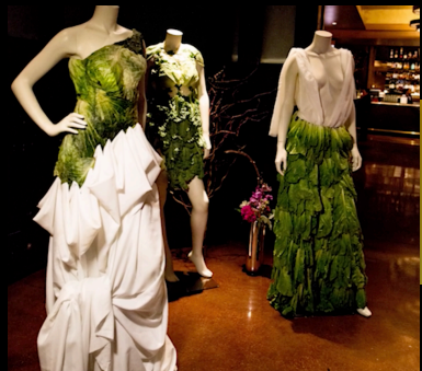
Gowns made of lettuce