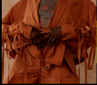
Upcycled fabric paired with flower petal tank top