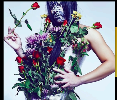
Dress with artificial flowers