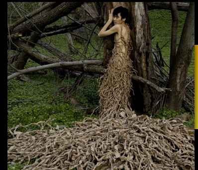
Rolled and coiled brown paper