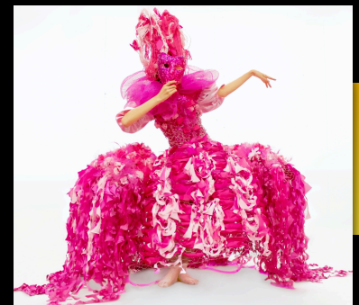
Satin, organza, flowers, glass, yarn, plastic netting