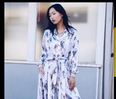
Custom printed silk-satin set