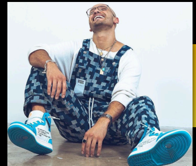
Upcycled patchwork denim overalls