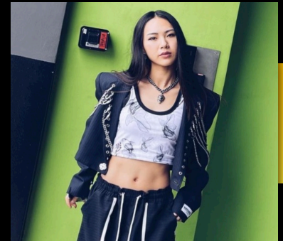
Upcycled fabrics and old chains