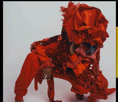
Upcycled editorial piece