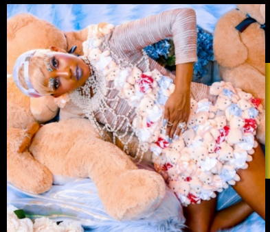
Teddy bear skirt