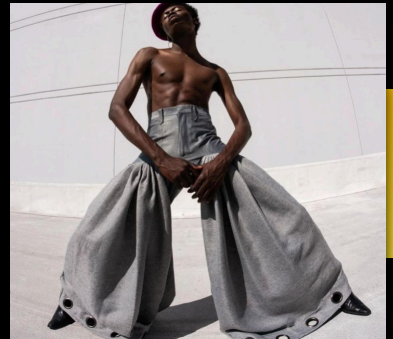
Pants from old curtains